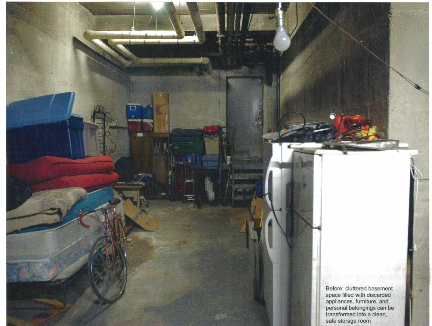
Before: cluttered basement space filled with discarded appliances, furniture, and personal belongings can be transformed into a clean, safe storage room

Check out the materials they use, what the storage rooms look